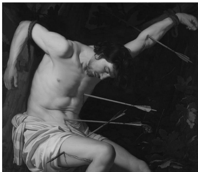
Saint Sebastian Feast Day 20 January.

From the Life of Saint Antony by Saint Athanasius, bishop